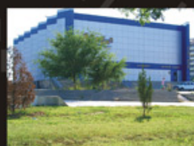
Casino "Laguna"; reconstructed cinema "Jubilenj" (2004)