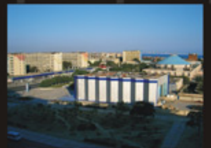
City Centre (2004)

In the area of the central ensemble the planners put special attention to the design of green and open spaces. Furthermore, they tried to incorporate tradition and modernity in the architecture of the Soviet "plan city". The yurt shaped rooftop of the trade centre "Schum" symbolizes this approach.