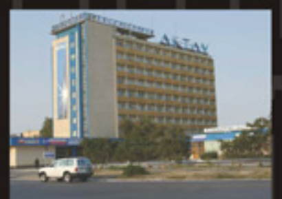
Hotel "Aktau" (2004)