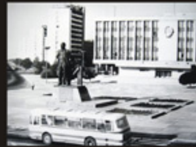
"Lenin square" with town hall (1985)