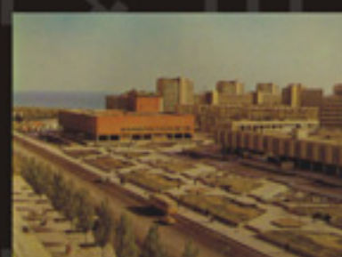
Palace of culture "Abal" (1980s)