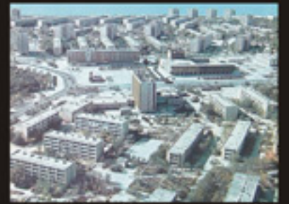
Aerial view of the city centre (1980s)

Following the basic ideas of urban design the city centre was built up in an archetype socialist way. Strictly separated from residential areas it consists of the town hall, a hotel, a cultural centre, a retail trade centre, a cinema and an accommodation building for single workers.