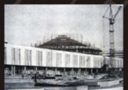
Erecting the roof of the public and shopping center "Schum" (1979)