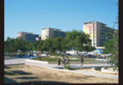
Designed green spaces (2004)

Following the basic ideas of urban design the city centre was built up in an archetype socialist way. Strictly separated from residential areas it consists of the town hall, a hotel, a cultural centre, a retail trade centre, a cinema and an accommodation building for single workers.