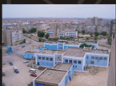
Kindergarten in the 28th microdistrict

To minimize the negative impacts by street traffic and industry the residential microdistricts were oriented to their insides. They possessed of all supply facilities which were thought necessary for the local population. Child care, schools and retail trade were located within walking distance to all residential buildings.