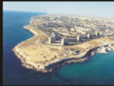
Aerial view of the 4th microdistrict (Early 1990s)

From the very beginning the structure of the "plan city" Shevchenko was based upon typical concepts of Soviet urban planning. A strict separation of functions as well as the foundation of dense microdistricts were of big importance. Thus a clear edge between city and steppe areas became characteristic.