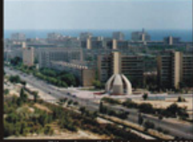
7th microdistrict (around 2000)