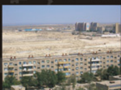
Steppe bordering the 12th microdistrict