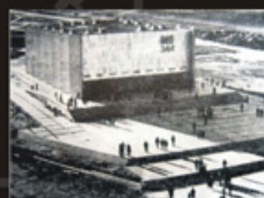
Cinema "Jubilenj" (1968)