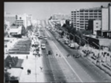
Main street "Lenin prospekt" (1980s)