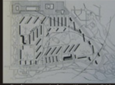
Draft concept of the 4th microdistrict (late 1960s)