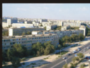
School and hospital in the centre of the 7th microdistrict

To minimize the negative impacts by street traffic and industry the residential microdistricts were oriented to their insides. They possessed of all supply facilities which were thought necessary for the local population. Child care, schools and retail trade were located within walking distance to all residential buildings.